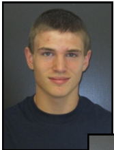
Kevin-Service & Floors

We would like to announce our newest members to the Sparkle team! The more customers we partner with, the more jobs we can create for our community!